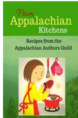
Craving some delicious mountain recipes?